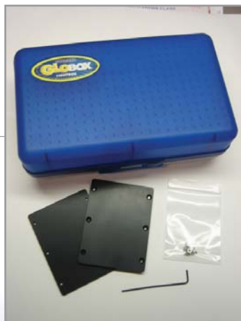
Lightbox with extender plates and hardware (purchased separately).